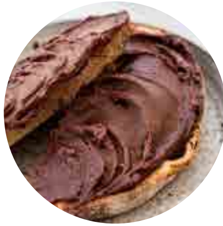
Chocolate Syrup Praline Spread Chocolate Syrup Cherry Syrup Caramel Syrup