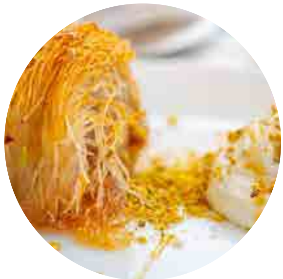
Fyllo Baklava Fyllo Kataifi