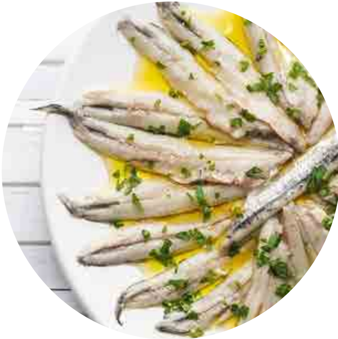
Sardines Whole Salted Anchovy Whole Salted