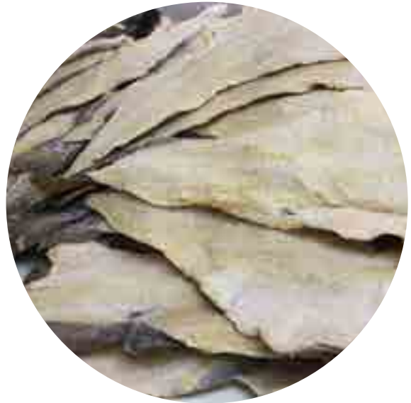
Cod Fish Whole Salted