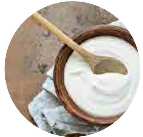
Greek Strained Yogurt 100% Greek Strained Yogurt 100% with flavors