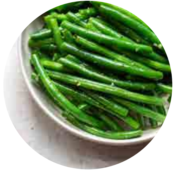
French Beans Green Peas String Beans Ocrá