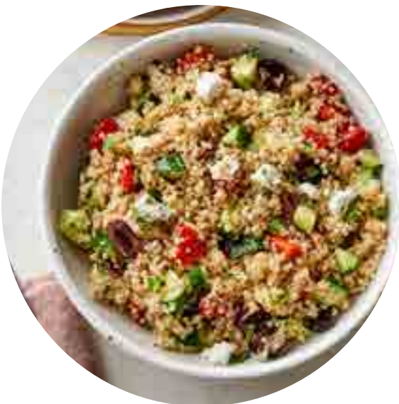
Quinoa Black, White, Red Tricolore Quaker Oats Muesli with Fruits Corn Flakes