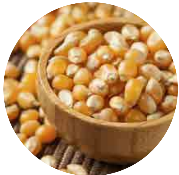
Sesamy (Natural, Roasted, Black, without Shell) Sunflower Seeds Pumpkin Seeds Popcorn Raw