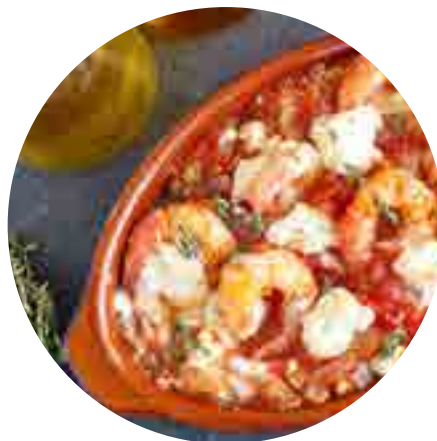
Shrimp Headless with Shell Mussel Meat