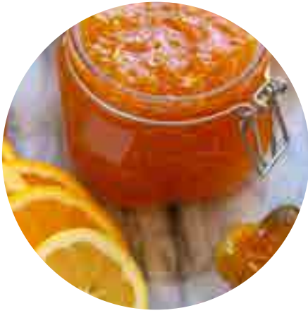
Marmalades Strawberry Orange Apricot Cherry Peach