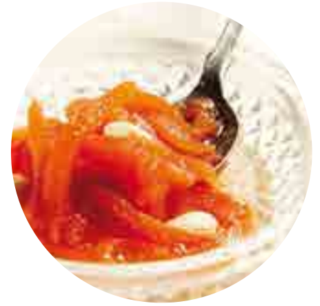
Spoon Sweets Orange Bitter Orange Bergamot Cherry Sour Cherry Quince Grape Fig Rose Petals