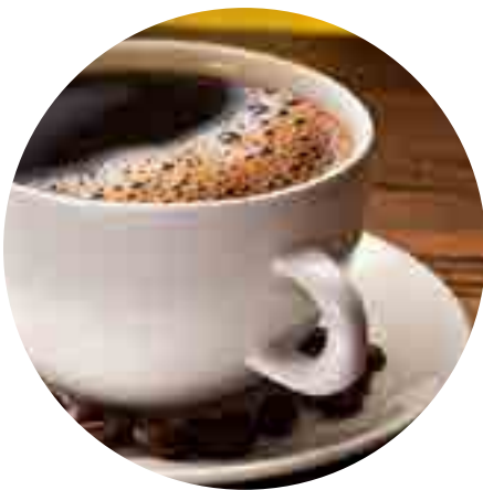
Coffee Ground (Filter)