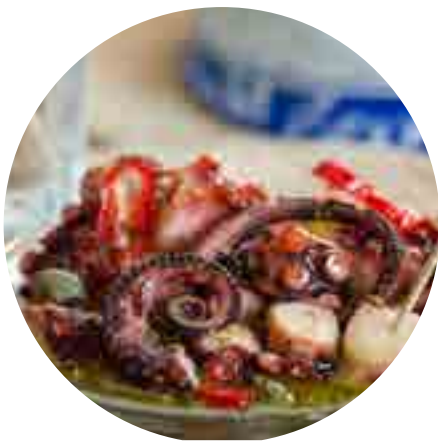
Octopus Whole Octopus Tentacles