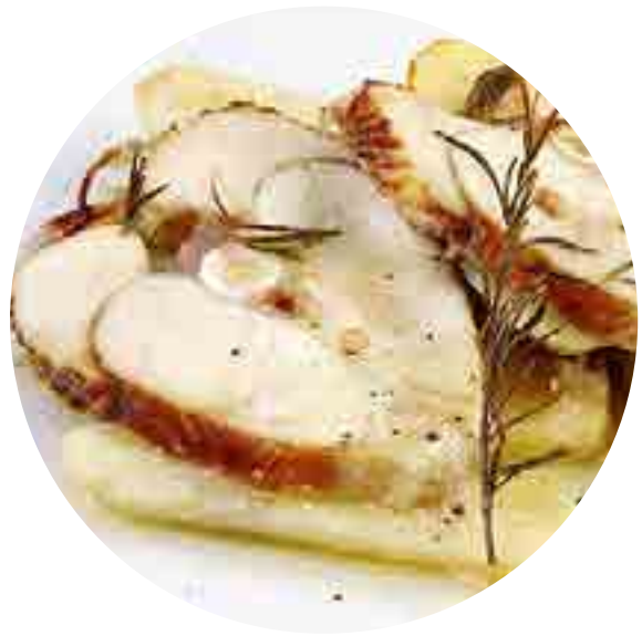
Hake Fillet Blue Shark Fillet Pangasius Fillet Salmon Fillet