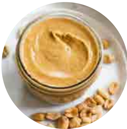
Tahini Peanut Butter