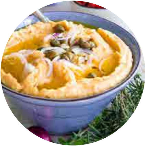
Chick Peas Dry Split Peas Yellow Dry (Fava)