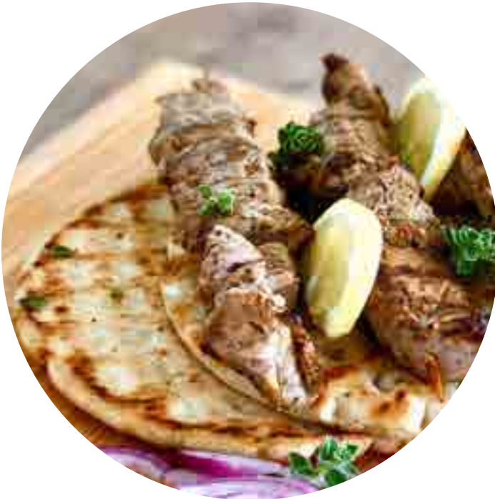
Pita for Souvlaki