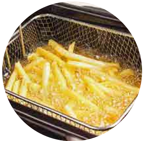
Frying Oil Salad Oil (flexible to mix combinations such as 80% sunflower/20% pomace oil)