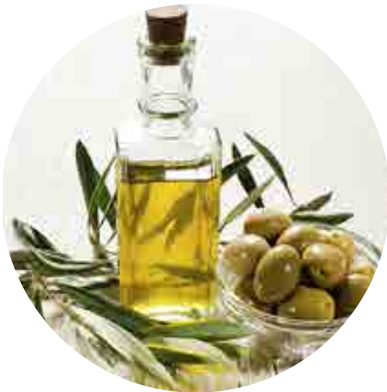
Extra Virgin Olive Oil Classic Olive Oil Pomace Oil