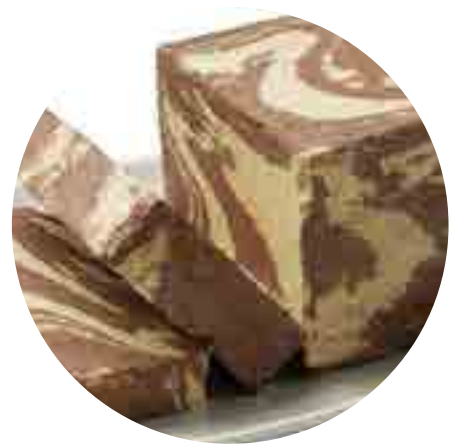
Halvas with Vanilla with Cocoa with Almonds