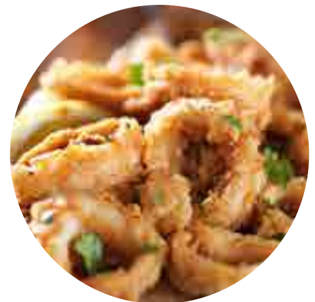
Squid Whole Squid Rins Cutterfish/Ink Fish Whole