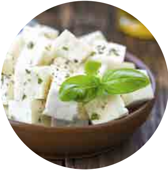
Feta Cheese PDO Greek White Cheese White Vegetable Cheese