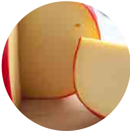
Edam Yellow Cheese Gouda Yellow Cheese Emmental Yellow Cheese Cheddar Yellow Cheese