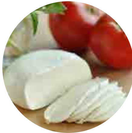
Italian Hard Cheese Mozzarella Haloumi PDO Cyprus White Cream Cheese Philadelphia Type