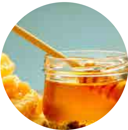
Honey Blossom Thyme Forrest