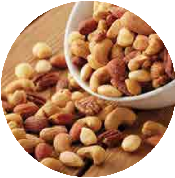
Halelnuts Almonds Walnuts Peanuts Cashew Nuts Mixed Nuts