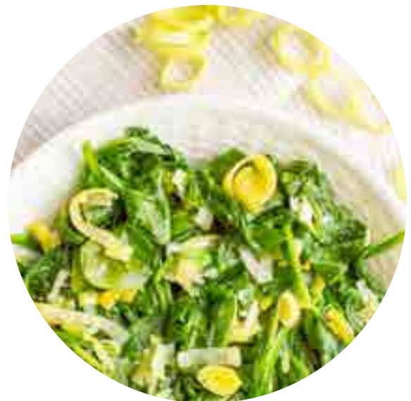
Dill Chicory Celery Leeks Tomato