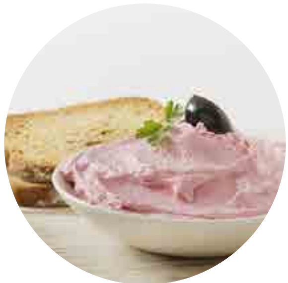
Taramas White Red Taramas Fine Paste 15%