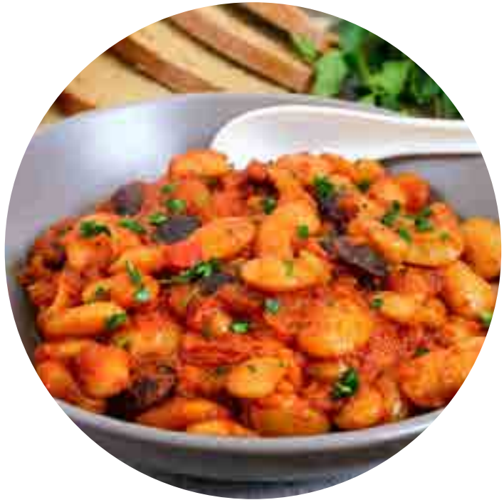
Navy Beans White Dry Butter Beans Dry (Gigantes)