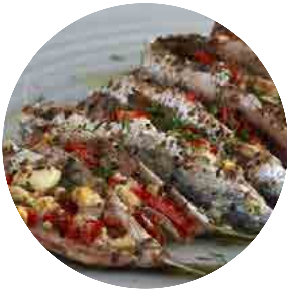
Seabass Whole Seabream Whole Sardines Fillet Anchovy Fillet Red Fish Whole