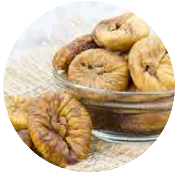
Raisins Black Raisins Golden Dried Prunes Dried Figs