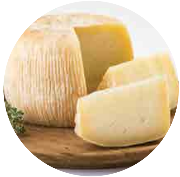
Kasari Yellow Cheese PDO Greek Semi Hard Yellow Greek Cheese Kefalotyri White Cheese PDO Greek Hard White Greek Cheese Gruyere Yellow Cheese PDO Greek Gruyere Yellow Cheese